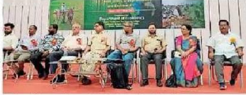
राजीव गांधी स्नातकोत्तर कॉलेज में देश-विदेश से पहुंचे वक्ता।